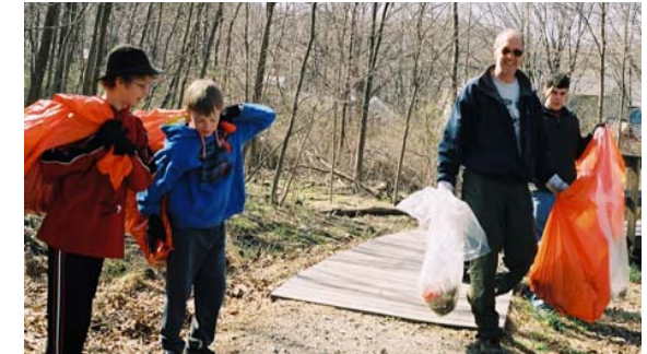
Cleaning up the local waterways during our Annual Stream Clean-Up.

SBWA Activities Offer Many Different Ways for You to Become Involved in the Watershed