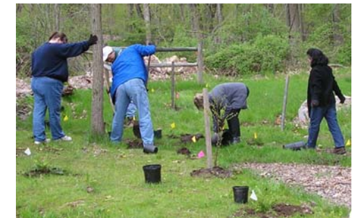
Planting tree saplings during a local stream restoration.