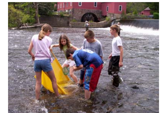
Educating local school students about water quality in the watershed.