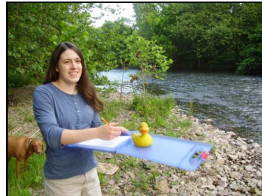
A volunteer conducting a visual survey at one of our stream monitoring sites.

Give us a call today to find out how you can get in on the action and have fun along the way!