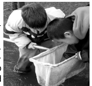
What Did We Catch?! Holland Brook School Students Checking out Their catch at the South Branch Raritan River in Three Bridges.