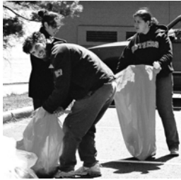
Some of the Trash Collected Last Year at Round Valley Reservoir

Our 16th Annual Spring River Clean-up will be held on Saturday, April 22nd, from 9 a.m. to 12 p.m. Volunteers are needed to help clean up the river and surrounding land throughout the entire watershed from Budd Lake in Mount Olive Township to the confluence in Branchburg. Come join us and spend the morning giving back to your community!