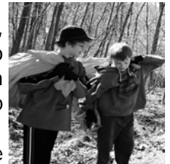
Hauling Trash Away from the River in Califon