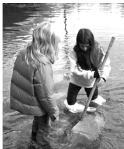
Holland Brook School Students Collecting Macroinvertebrates at the South Branch in Three Bridges.

the environment and an appreciation of the ways that human behavior can positively or negatively impact natural systems.