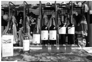
Wine at the Clinton Rescue Squad

A silent auction was held offering diverse gifts from a Gourmet dinner for 10 served in your home, a Key West Sport Fishing Trip with lodging, professional photographs of South Branch Ken Lockwood Gorge, and many more surprises. Tickets were drawn for large bottles of wine.