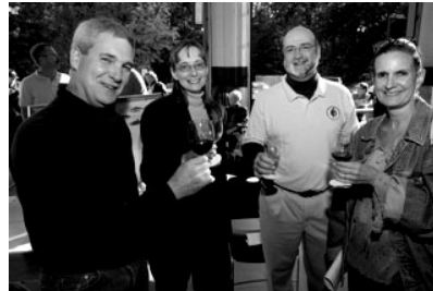
Some of the Delighted Tasters