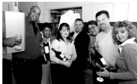
More Happy Winners!