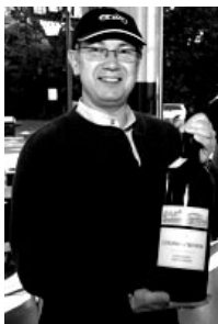
A Happy Winner!