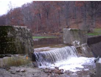
Notched YMCA Camp Dam in Mount Olive

Last winter I wrote about the growing efforts to remove obsolete dams from waterways throughout the United States. Major efforts are underway to remove dams in California, Oregon, and Washington. Closer to home, dams are being removed to improve water quality and fish passage in Maine, New Hampshire, Massachusetts, and Pennsylvania. Right next door to our watershed, the Musconetcong Watershed Association, working with Trout Unlimited and others, just removed one obsolete dam and is preparing to remove a second.