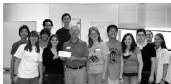
Hunterdon Central Students present SBWA with a $1,000 donation.