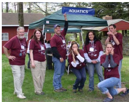
NJ Envirothon Aquatics Station Team 2009

Princeton Community Works - Princeton University – January 26 (attendee) ANJEE Conference - Princeton University – January 29-31 (attendee and volunteer) Schuylkill Watershed Congress - Montgomery County Community College – March 7 (attendee) Stanton Church Women's Breakfast – April 18 (exhibitor) Basil Bandwagon Earth Fair – April 18 (exhibitor) Hunterdon County Parks and Recreation Earth Day at Deer Path – April 25 (exhibitor) NJ Envirothon – School of Conservation – May 9 (aquatic station test grader) Flemington Jewish Community Center Environment Fair – May 20 (exhibitor) Buffalo Watch at Readington River Farm – May 23 (exhibitor) Readington Community Day – May 25 (exhibitor) National River Rally - Baltimore, MD - May 29 – June 1 (attendee) Somerset Patriots Environmental Conservation Night – June 1 (display) Public Presentation on Dam Removal at Mt. Olive – July 8 Alexandria Twp Environmental Commission – Presentation on SBWA & Watershed – July 28 Presentation on SBWA Education Program to Schering-Plough – August 10 Tour of Walnut Brook with Congressman Lance – August 21 Hunterdon County 4H Fair – August 19 – 23 (display) ANJEC Environmental Congress – October 17 (display and attend) NJ DEP Volunteer Monitoring Summit – November 18-19 (present and attend)